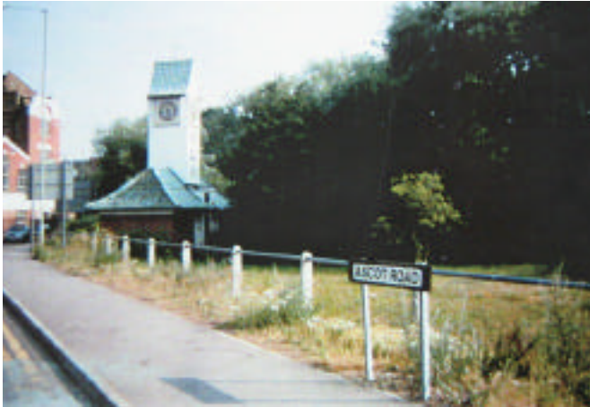
Ascot Road & Sun Clock Tower