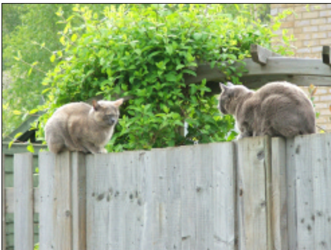
You look awfully familiar!