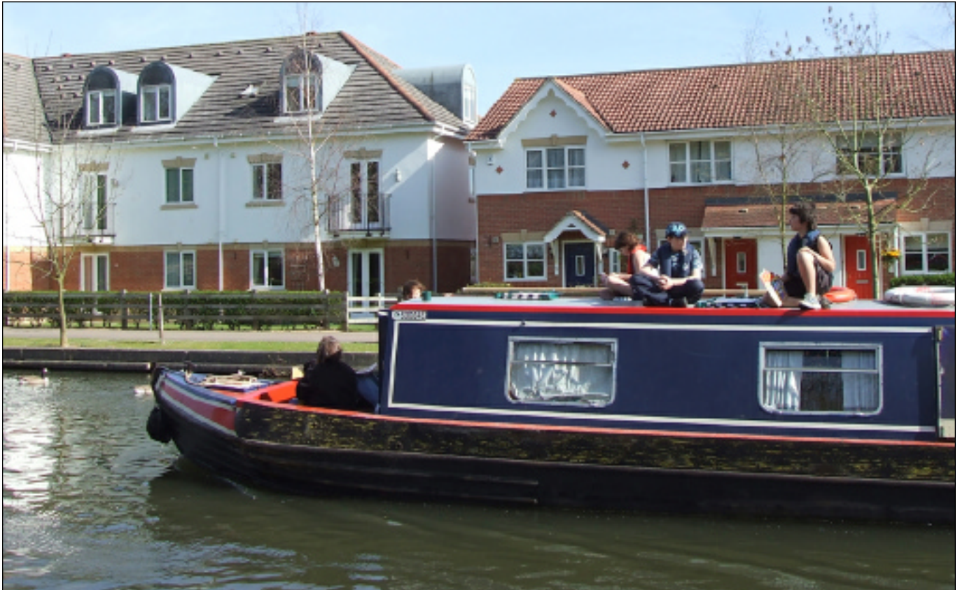
At last – some sunny days!