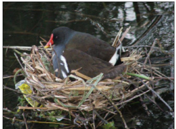
A new home on Byewaters